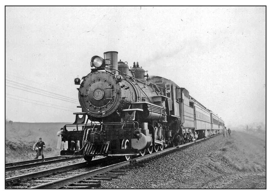
Ex GW #51 has stopped at Plainview in heavy fog on April 17, 1966, on the way to the Moffat Tunnel while steam was built up due to dirty coal. Some club members were able to take photos at this location.

- Neal Miller photo, Tom Klinger collection.