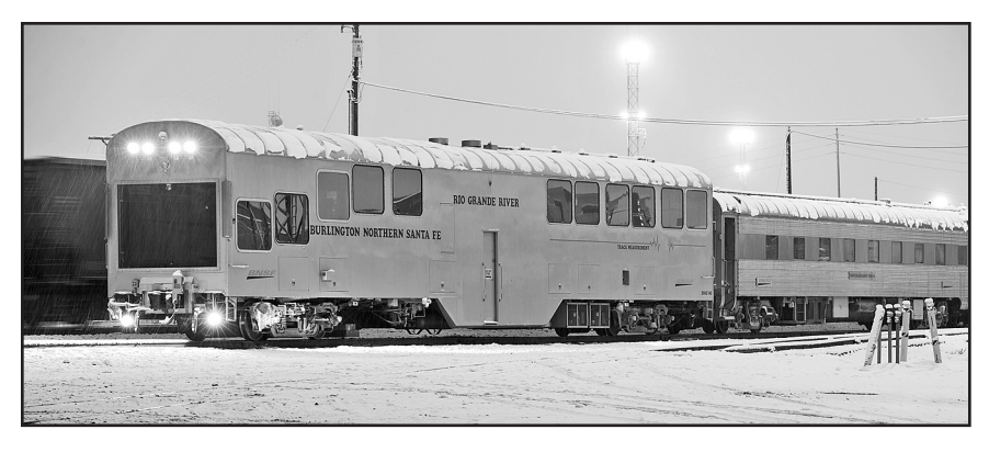
BNSF 80, Rio Grande River, track geometry car ready on train U DENSTE5 12z, Denver to Sterling, Colorado, in snowy Denver on March 12, 2013. Note all the inspection lights on BNSF 80. The three-car train departed after a late Amtrak train 5 arrived. BNSF 5236 led the speedy train across the snow white eastern Colorado prairies.