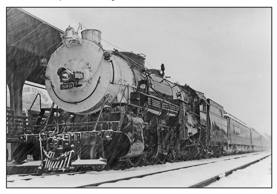
C&S #809 at Denver Union Station is waiting to depart for Golden for the Club's annual dinner on April 8, 1959.