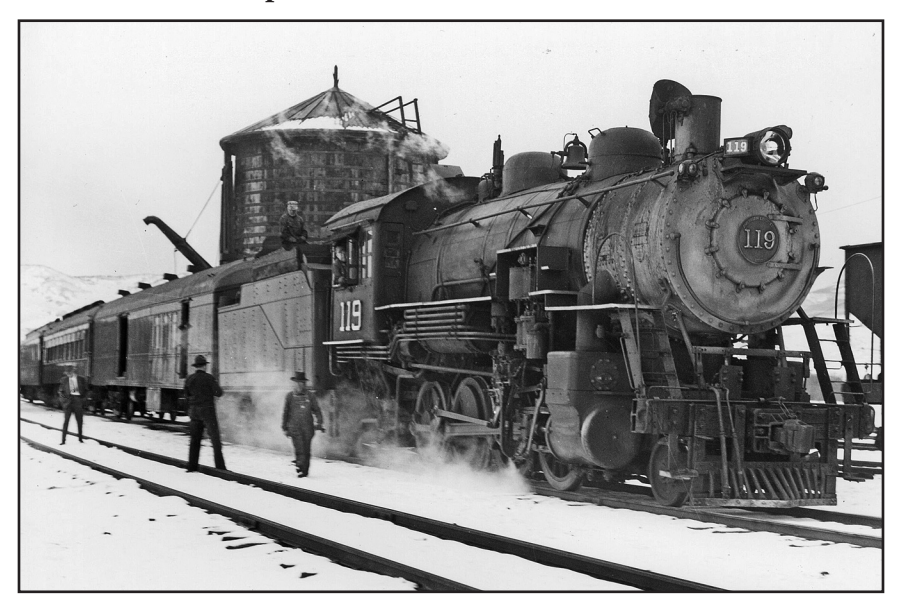
D&SL #119 has stopped at Phippsburg on the return to Denver from a Club trip to Craig, Colorado, on April 25, 1948.